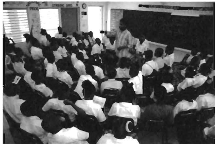
Empty Hands #6 , Performance at Ridgland Park Primary School Nassau, Bahamas.

In July 2006 the recent Yale MFA sculpture graduate Tavares Strachan first presented in his hometown of Nassau the monumental Chamber with Ice: Elevator for the Reversal of Up and Down . 1 It is the main segment of the installation The Distance Between What We Have and What We Want that he would exhibit in its entirety six months later in Miami. 2 Chamber with Ice consists of a specially built refrigerator with glass doors housing a block of ice weighing 4.5 tons, which Strachan collected in the Arctic Circle. The Nassau presentation of The Distance Between... , featuring Chamber with Ice , incorporates an array of solar panels together with a generator, which harnesses and conducts this power in order to run the refrigerator. This piece is punctuated with a specially designed flag and a guard wearing a variation on the Bahamian dress uniform. Strachan arranged for the components comprising the first presentation of The Distance Between... to be placed both under and adjacent to the expansive roofed section of the playground adjoining the Nassau-based Albury Sayle Primary School where he had once been a student.