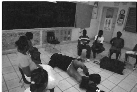
Empty Hands #4 , Performance at Ridgland Park Primary School Nassau.

Granted permission to present a series of lecture/workshops to children enrolled in this and other Nassau schools