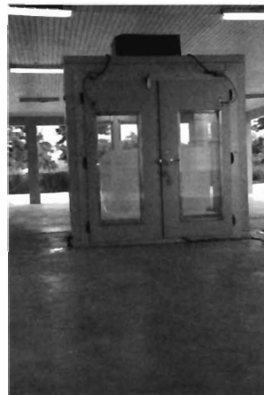
Solar Powered Freezer

that he encapsulated in a solar-powered refrigerator serves as a metaphor of nature placed on life-support, turning it into a strange futuristic assemblage. It is ironic