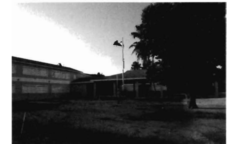
The Sentry stands guard at the School grounds.

This attendant was dressed in a uniform that looks like the colonial ones still worn by guards standing outside some of Nassau's official government buildings, except for the fact that it was made of the same aquamarine blue as the Bahamian flag. Dressed in this way the guard's custom-made uniform both signals official sanction at the same time that it undermines it.