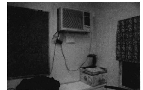
Internet connection at the school