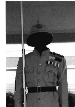
The Sentry, used practically as a unit of protection and a revision of the British guard.

The erasure of boundaries was also a subtext to the performance inaugurating the presentation of The Distance Between... in Nassau. For this low-key performance, Strachan arranged for a guard to stand at attention throughout the evening.