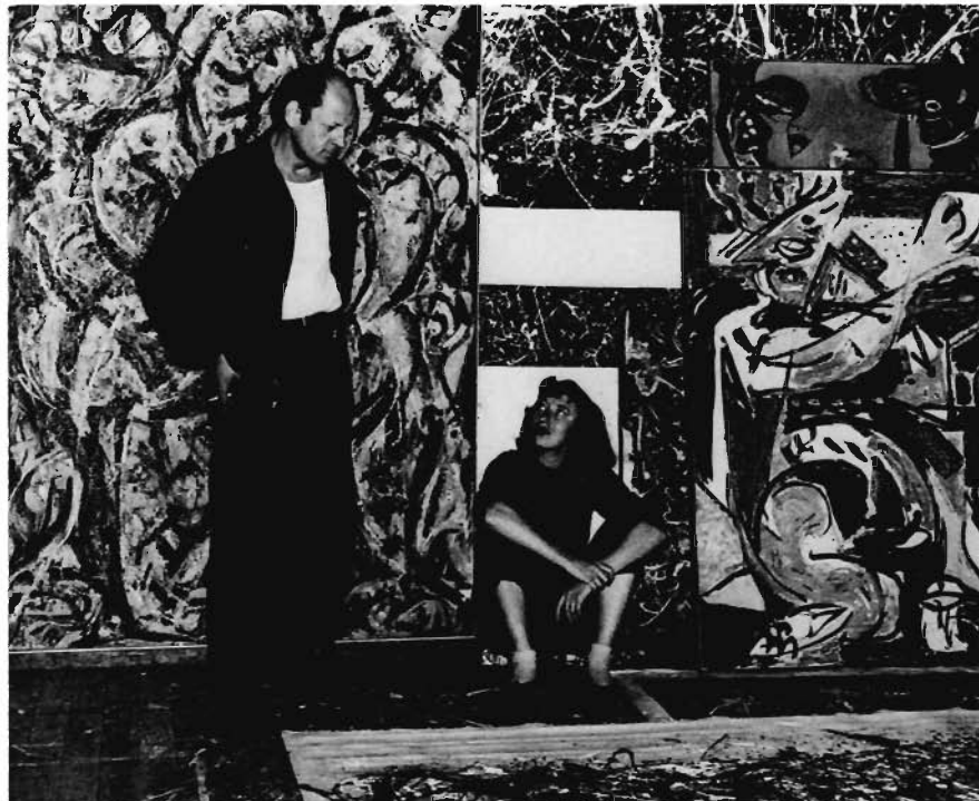
Lee Krasner and Jackson Pollock in Pollock's studio, ca. 1949

Pollock, as the following headline descriptions of her readily demonstrate: “Out of the Shade,” “Overshadowed by Late Husband,” “Out of the Shadows to Gain Recognition,” “Out of Jackson Pollock’s Shadow,” “Bursting Out of the Shadows,” “Shining in the Shadow,” and “In the Shadow of an Innovator.” Using such catch phrases, these writers have unfortunately legitimized the problem by rallying around it. 4 As Krasner herself commented, “The cliché is that Lee is overshadowed by her husband and that’s easy and we don’t have to think about it. It is outrageous.” 5 And so it is.