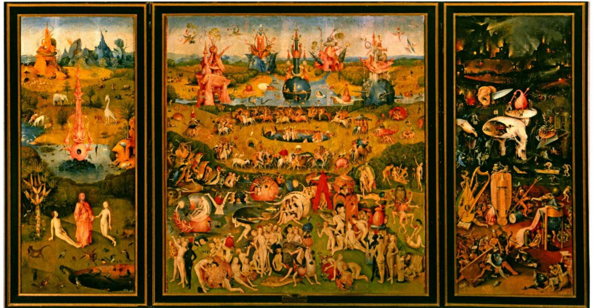
The Garden of Earthly Delights 1500–1505 Hieronymus Bosch, c. 1450–1516 (Creation/Garden of Earthly Delights/Hell) Oil, grisaille on wooden panel 220 × 389 cm (87 × 153 in.) Museo Nacional Del Prado, Madrid

Grotesque was able to shock; for example when one type of entity, say a machine, was found germinating or even erupting in a biological form. By mimicking the human body, this machinic element caused a feeling of panic; it threatened one's views of the strict boundaries operative in the world. Such hybridisations no longer confound or displease; instead, they reaffirm the dynamism of a world in which new and radical fusions are expected.