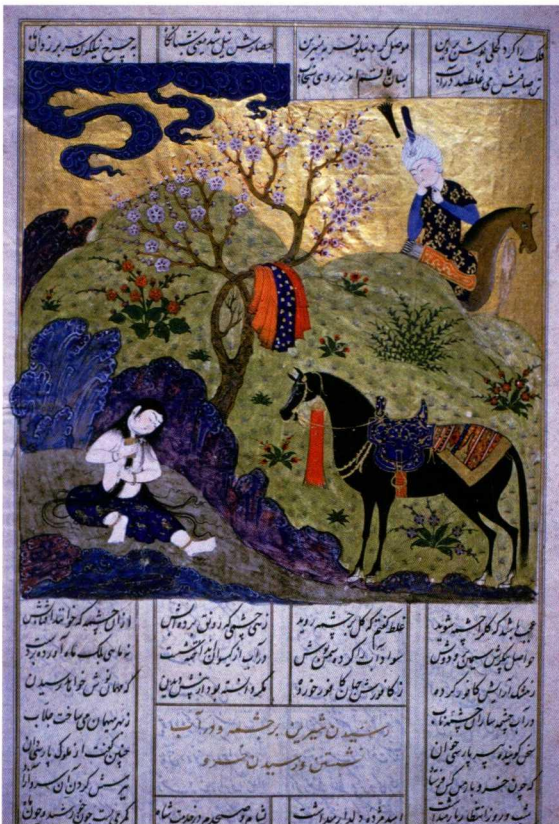
Chamse Chosrau und Schirin (Khusrau spies Shirin bathing) 1460 Nizami Ganjavi, c. 1141–1209 Persian miniature Gouache on paper Shīrāz school of painting, Iran