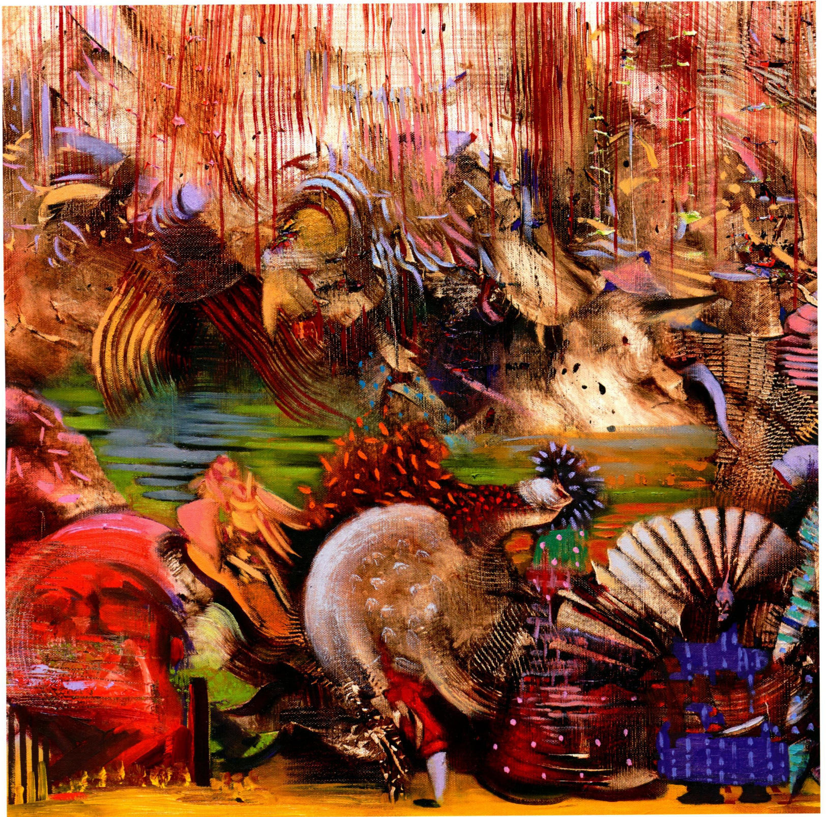
The Lower Depths (detail) 2014 Oil on linen 61 x 61 cm (24 x 24 in.)