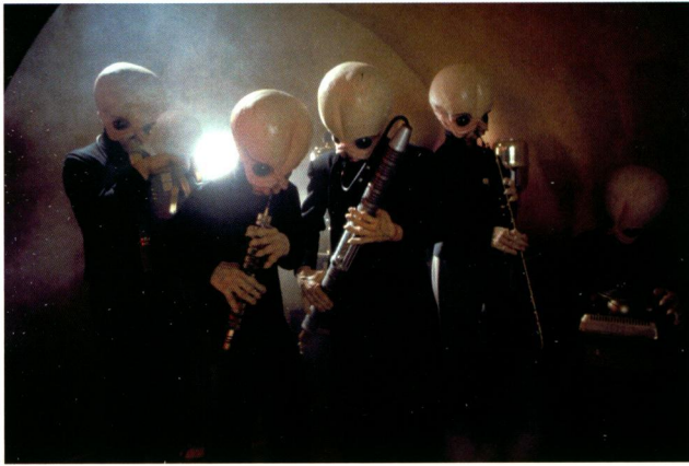
Star Wars: Episode IV (film still) 1977 Directed & written by George Lucas, b.1944

This in-between is evidenced in his overlapping of artistic styles and strategies, ranging from the Flemish painting of Hieronymous Bosch and Pieter Bruegel the Elder to sixteenth-century Venetian art, particularly Paolo Veronese's pageantry as evidenced in The Wedding Feast at Cana – a long-time Banisadr favourite in the Louvre – as well as the infamous Mos Eisley Cantina in Star Wars Episode IV with its monstrously conceived, yet endearing intergalactic pirates. Banisadr's preference for the intermediate is also found in his richly saturated hues, recalling Veronese's work but also landscapes after rainfall when 'colour is so intensified ... [and] everything [appears as a] hallucination.'