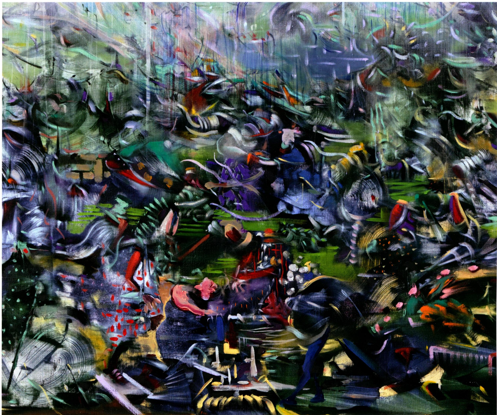
Control (detail) 2012 Oil on linen 76.2 × 91.4 cm (30 × 36 in.)