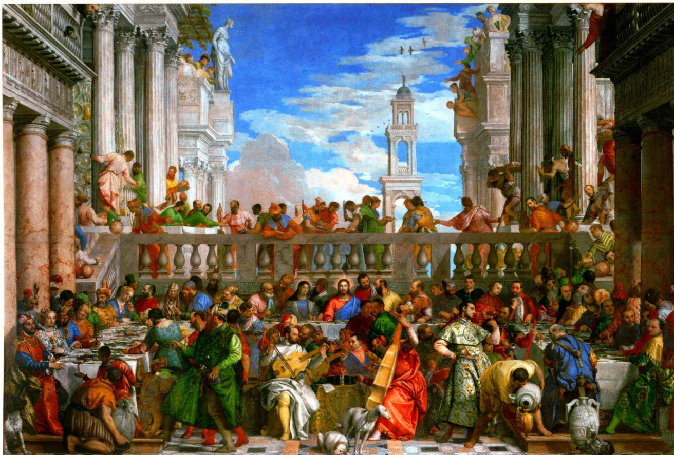
The Wedding Feast at Cana 1563 Paolo Veronese, c.1528–1588 Oil on canvas 677 × 994 cm (267 × 391 in.) Musée du Louvre, Paris